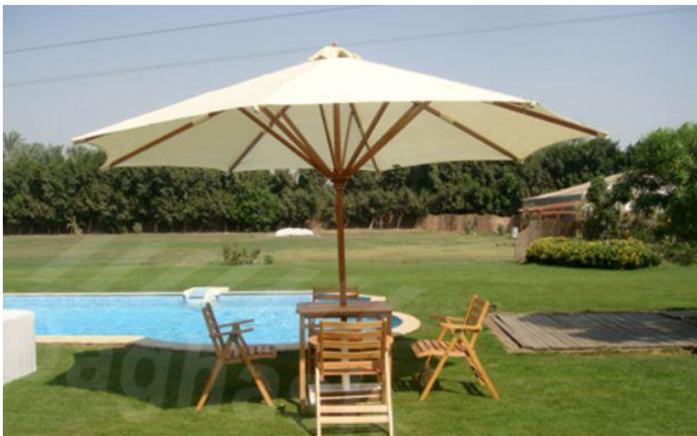
Fig. 13 – Example of Outdoor Area 01 Umbrella.