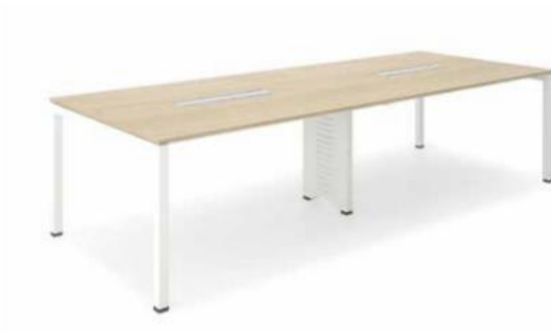
Fig. 04 – Example of Meeting table unit (without front modesty and cable management) – Items 1.5

(Kindly refer to Furniture Plan for further details).