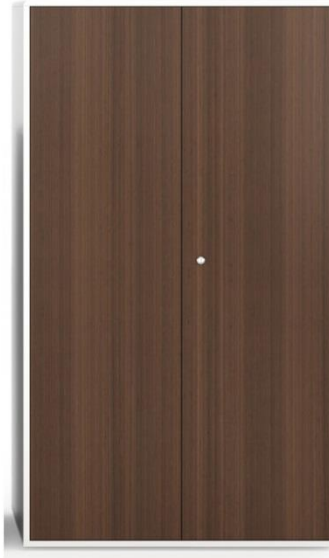
Fig. 07 – Example of Filing Cabinets – Items 1.9.