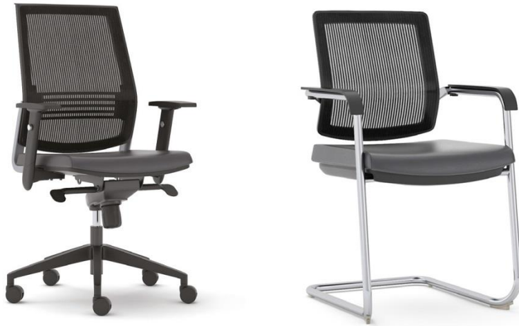
Fig. 06 – Example of Office Chairs – Items 1.7 & 1.8.