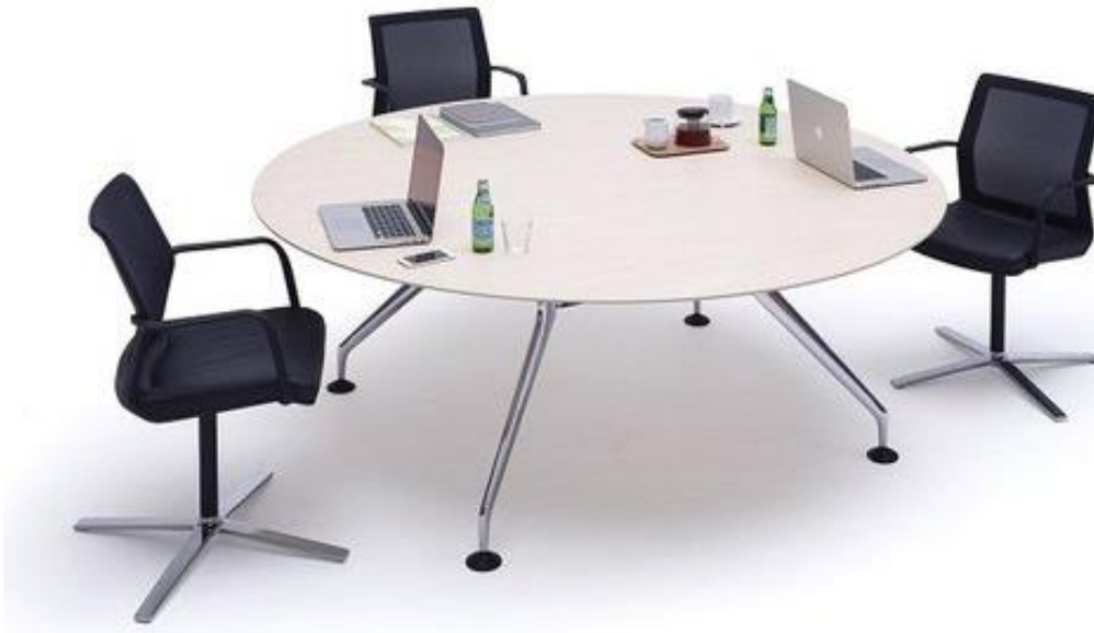
Fig. 05 – Example of Meeting table unit in Office 05 – Items 1.6

(Kindly refer to Furniture Plan for further details).