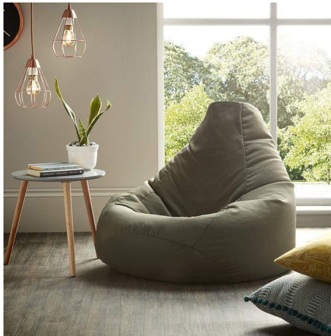
Fig. 10 – Example of Bean Bag Model and Material.

Bean Bags need to be 90 cm in diameter and with a comfy and a velvet fabric that can help the skin breathe (liquid repellent fabric).