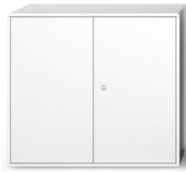
Fig. 09 – Example of Printer Area Units – Items 1.11.