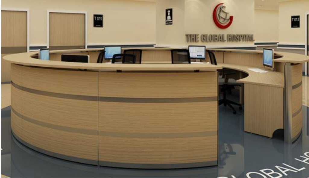
Fig. 02 – Example of Reception Desk – Item 1.3.

Operative Quarter of a circle Desk, with 18mm thick wooden top in laminate finish, with PVC Lipping, with wooden base.