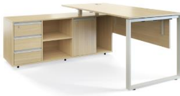
Fig. 01 – Example of Office Desk – Items 1.1 & 1.2.

Dimensions Needed for Item 1.2 is 150x170 (with Side Drawer Unit)