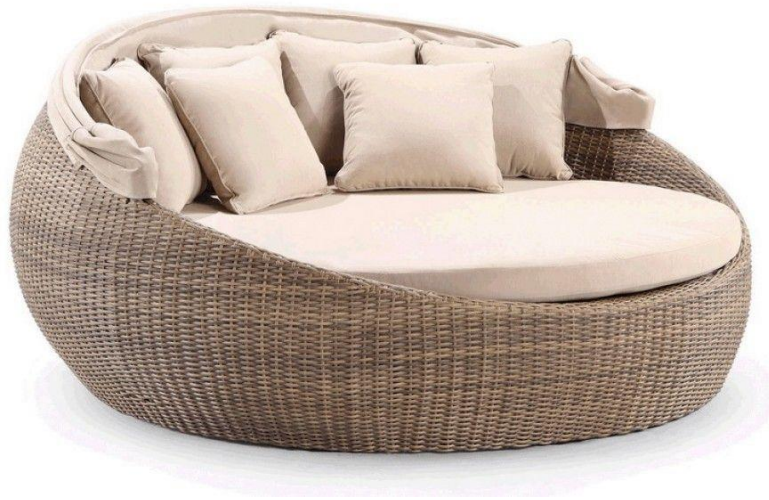
Fig. 12 – Example of Outdoor Area 01 Seating.

2 Bamboo wood made Circular seating with water proof and weather proof seating pad and cushions and a small bamboo wood coffee table.