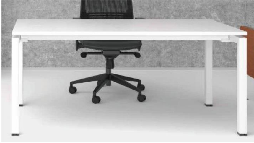
Fig. 03 – Example of Meeting table unit (without front modesty and cable management) – Items 1.4