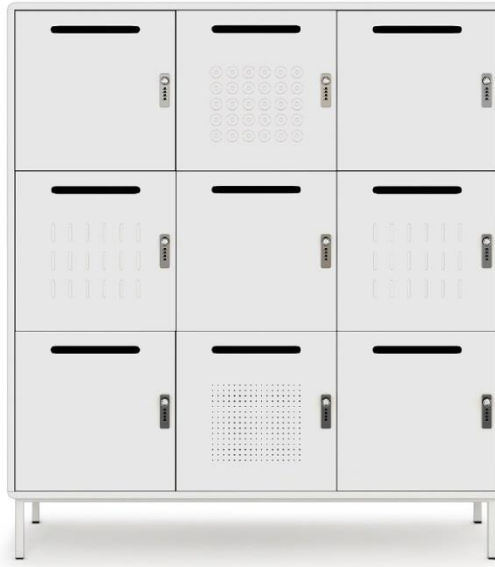
Fig. 08 – Example of Storage Room Lockers – Items 1.10.