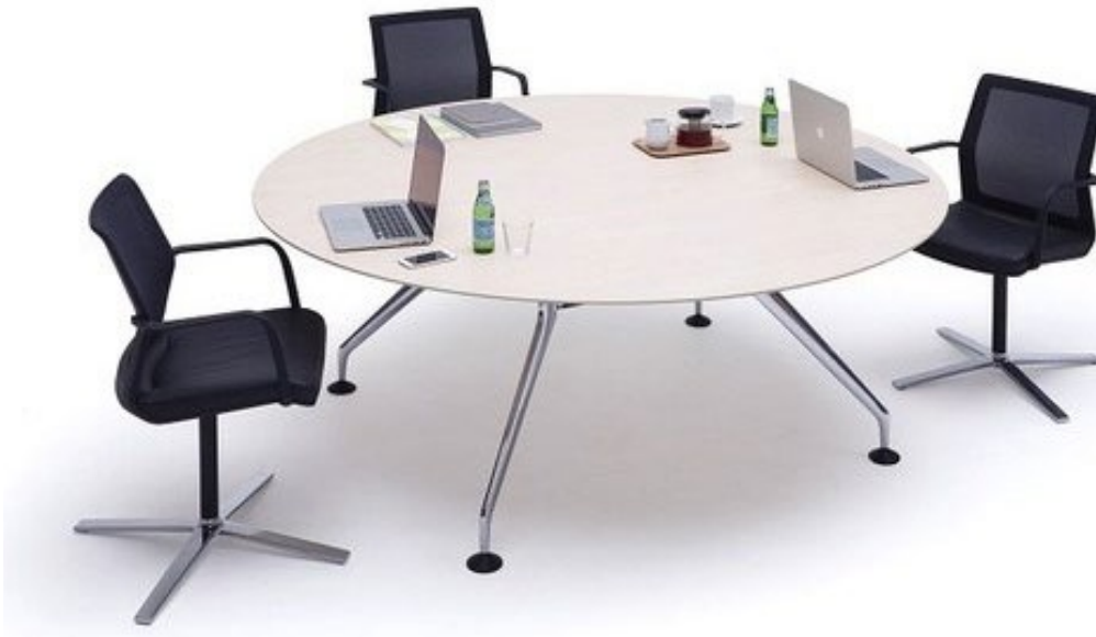
Fig. 03 – Example of Meeting table unit in Office 05 – Items 1.6