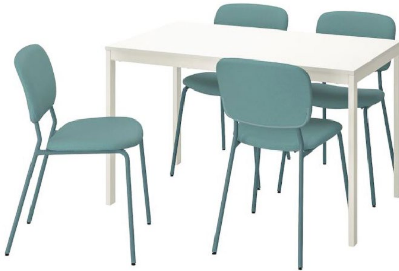
Fig. 9 – Example of Kitchen Dining Set with upholster seat.

Powder coated steel table legs with melamine foil and ABS plastic table top (dimension 120x75x67 cm) and a powder coated steel chair legs with upholstered back and seating with polyester. (as shown in fig. 9)