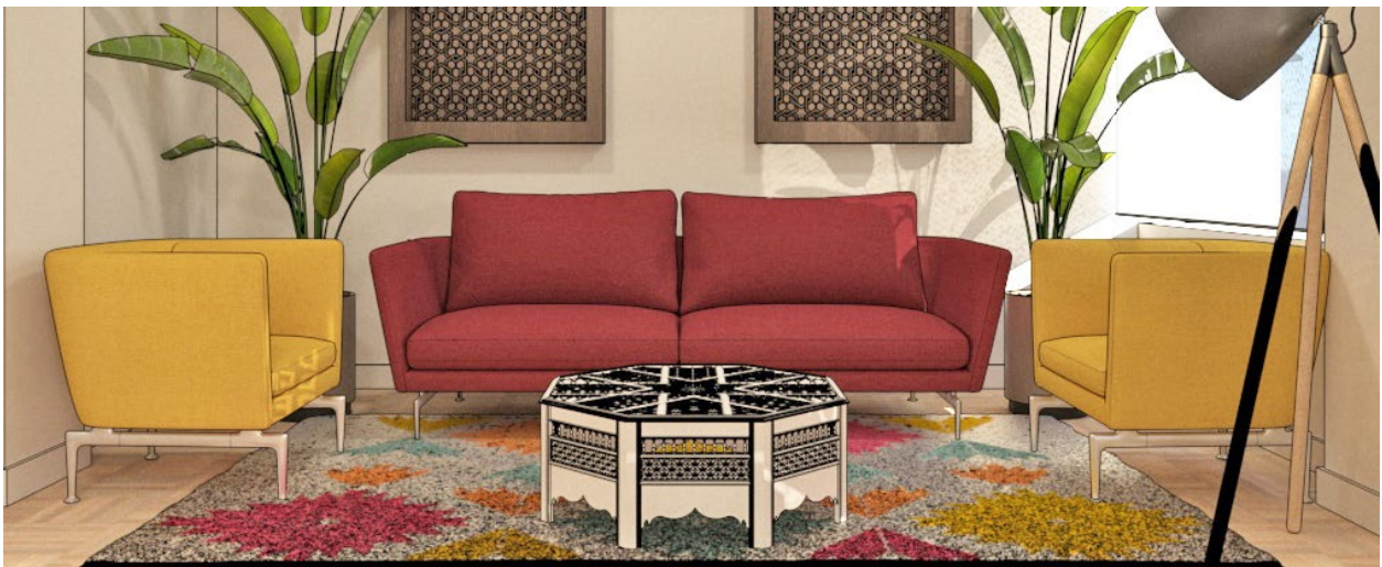
Fig. 8 – Example of Break Area Furniture Model and Material.

Selected Furniture samples and references should be emailed with dimensions and materials for written approvals.