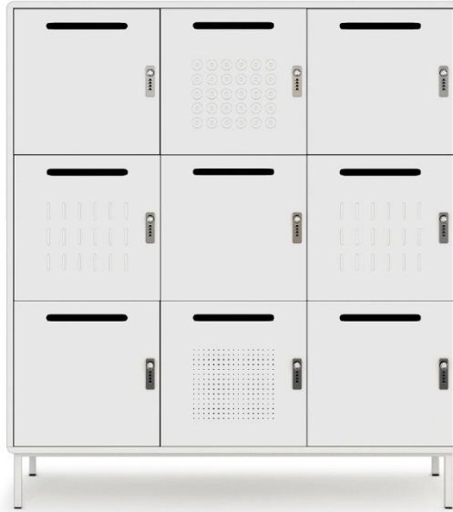
Fig. 06 – Example of Storage Room Lockers – Items 1.9.