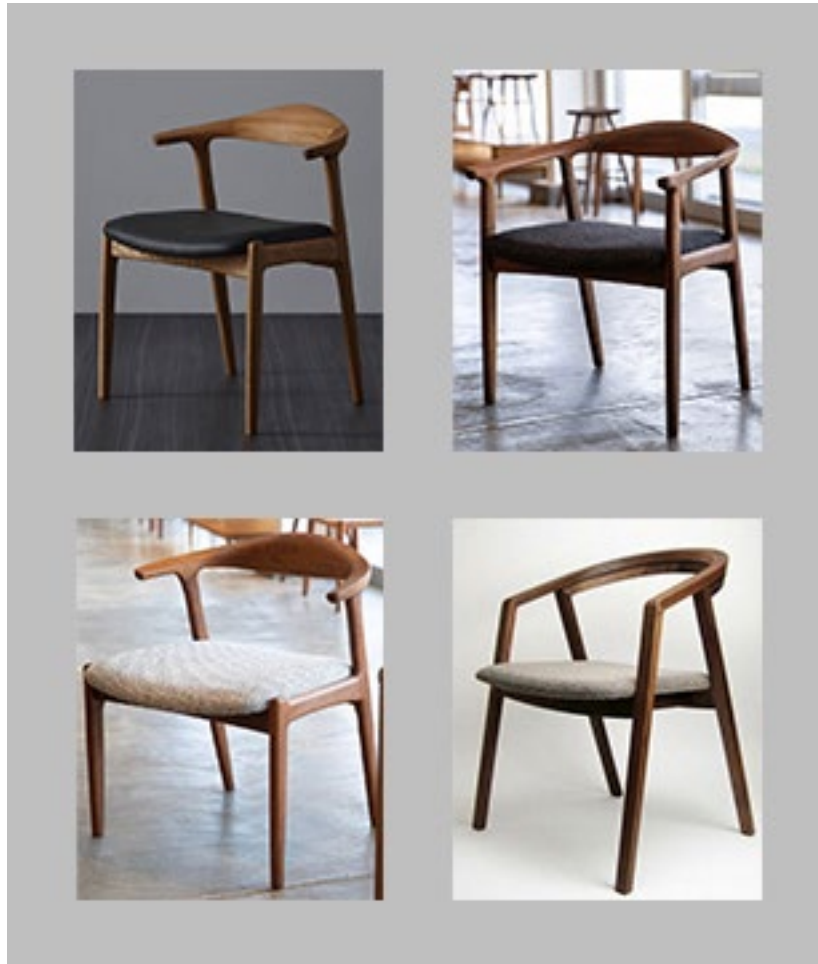
Fig. 14 – Example of Open Working Space - Seating Couch.