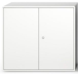
Fig. 07 – Example of Printer Area Units – Items 1.10.