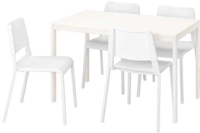
Fig. 13 – Example of Kitchen Dining Set with plastic seating for Kitchen.

Powder coated steel table legs with melamine foil and ABS plastic table top (dimension 120x75x67 cm) and a powder coated steel chair legs with upholstered back and seating with polyester. (as shown in fig. 13)