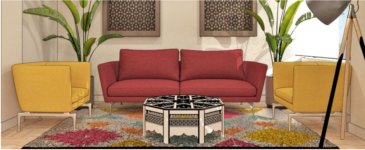
Fig. 10 – Example of 8th Floor Reception Area - Seating Set & Coffee Table