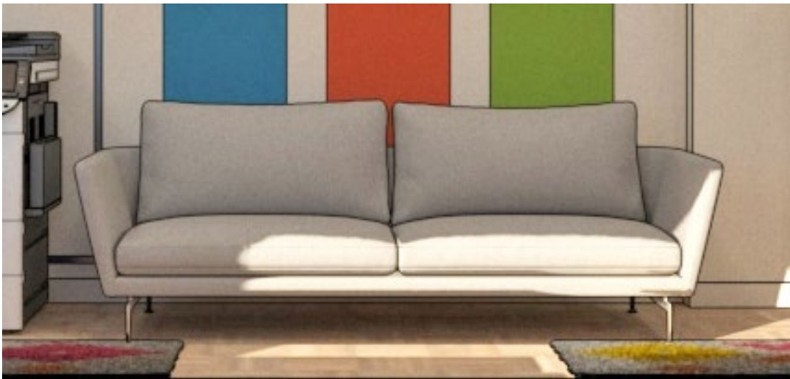
Fig. 12 – Example of Open Working Space - Seating Couch.

Selected Furniture samples and references should be emailed with dimensions and materials for written approvals.