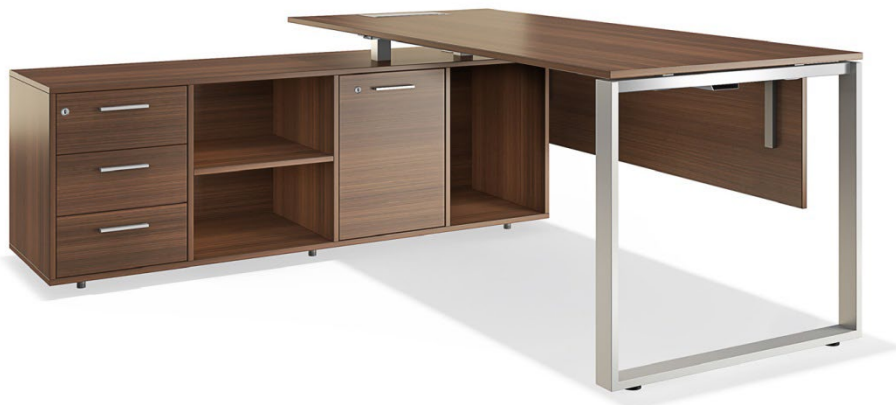
Fig. 01 – Example of Office Desk – Items 1.1 & 1.2.