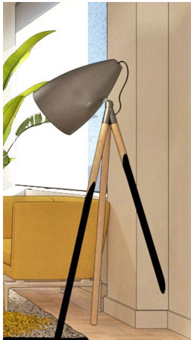
Fig. 11 – Example of Outdoor Area 01 Seating.

Selected Lighting Unit samples and references should be emailed with dimensions and materials for written approvals.