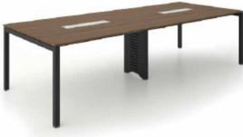
Fig. 02 – Example of Meeting table unit (without front modesty and cable management) – Items 1.3 and 1.5

(Kindly refer to Furniture Plan for further details).