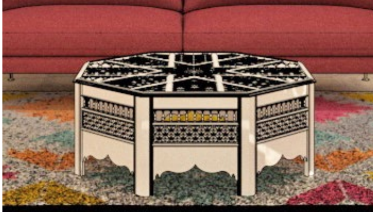
Fig. 16 – Example of 8th Floor Outdoor Area - Outdoor Coffee Table

Coffee Table to be Octagonal Arabesque Coffee Table with a radius of 60 cm