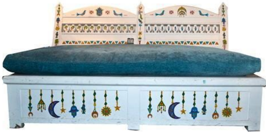
Fig. 15 – Example of Outdoor Couch.